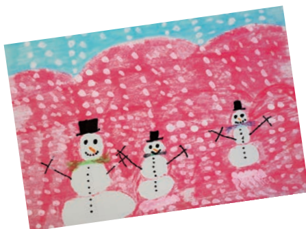
Snowmen in Pink