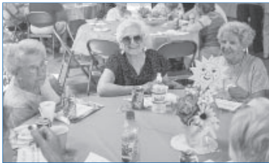
Residents of People Inc. Senior Housing enjoy a summer picnic.