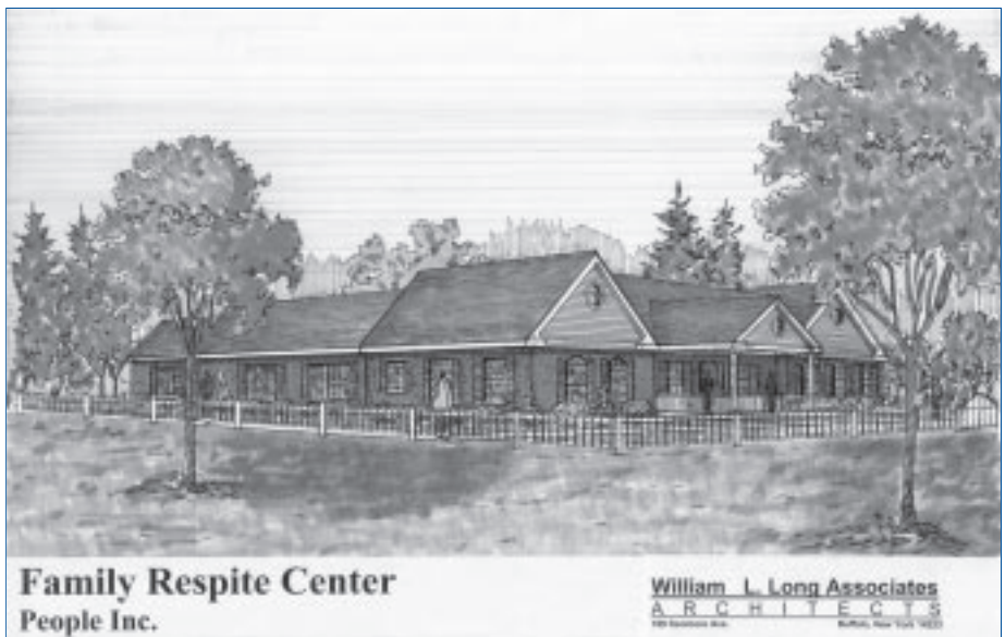
At right is an artist's rendering of the new Family Respite Center.